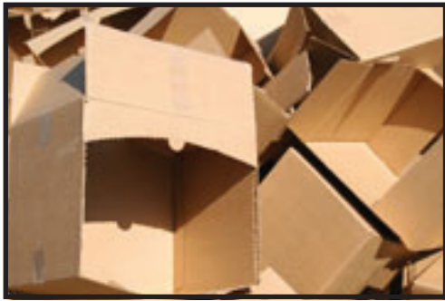
Turn Unwanted Boxes

Stop spending money on packaging materials and void fill and use your unwanted cardboard to protect your products, save and protect the environment.