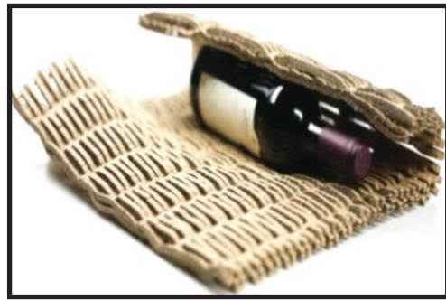
Into Free Packaging Material