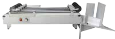
Conveyor & Drop-Tray Extension