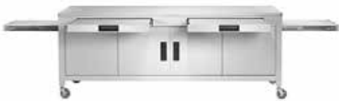
Cabinet for Printer & Conveyor